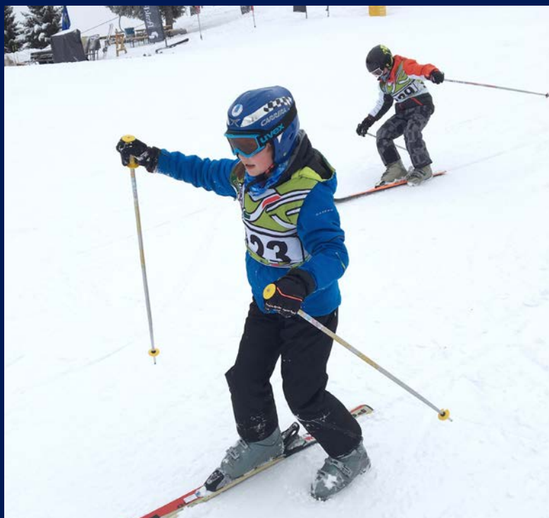
Chandlings Ski Tour to Folgaria

Follow us on twitter @chandlings_sch and find us on facebook @Chandlings